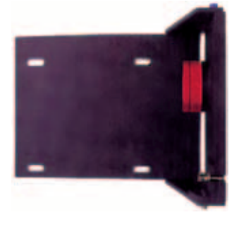
Model SOF-8 Swing-Out Fixture for Sight-Port Access