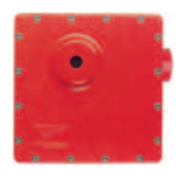
Model COP-10 Clean Out Rod for Clearing Sight-Port

FM14ATEX0004X IECEx FME 14.0001X Class I, Div. 1, Groups B, C & D, T4 Ta = -40 \, ^{\circ}\text{C} \text{ to } 60 \, ^{\circ}\text{C} IP65